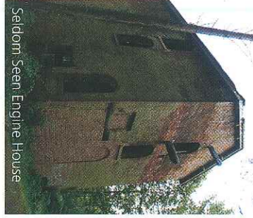
Seldom Seen Engine House