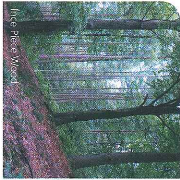
Ince Piece Wood

When the engine was removed, it left huge holes in the north and south walls. The engine house was still standing almost 100 years later but by 1987 it was in a dangerous condition. This rare building is the only surviving engine house for a vertical steam engine at a Derbyshire colliery. This led to Derbyshire County Council being granted a 20 year lease and it duly repaired and restored the structure for the benefit of the public. In 1998, English Heritage scheduled the engine house and its surroundings as a national monument.