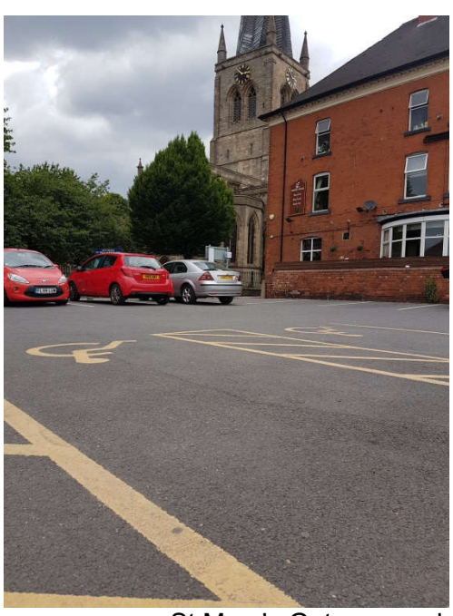
St Mary's Gate car park