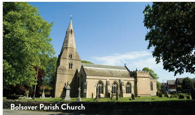
Bolsover Parish Church

Go through the gates at the end and enter the graveyard to the Parish Church of St Mary and St Laurence. This has a 13th century tower supporting a rather broad shouldered broach spire. The church was gutted by fire in 1897 and again damaged by fire in 1960. Excavations underneath the tower have revealed a large 13th century bell pit used for casting the medieval church bell in-situ.